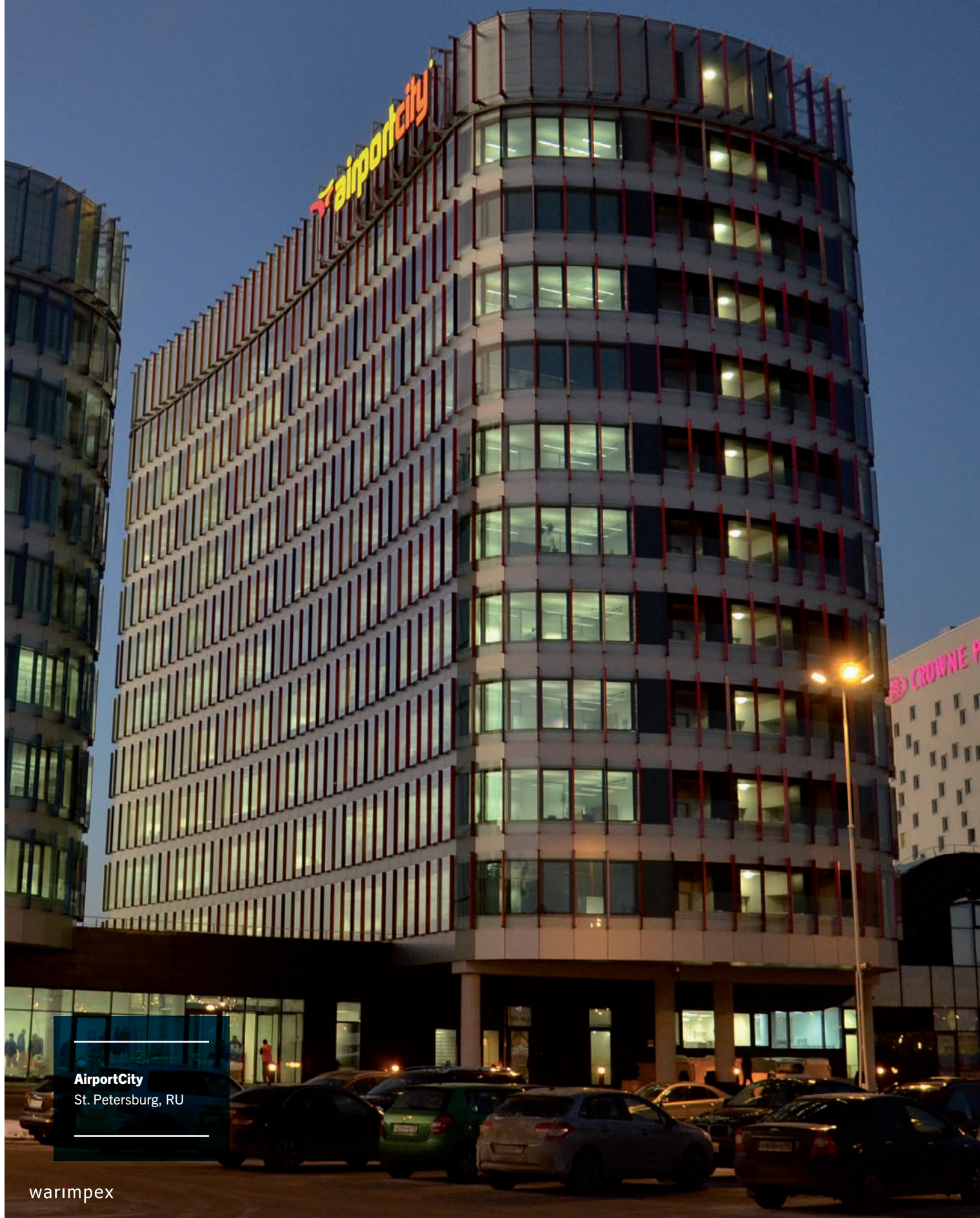
AirportCity St. Petersburg, RU