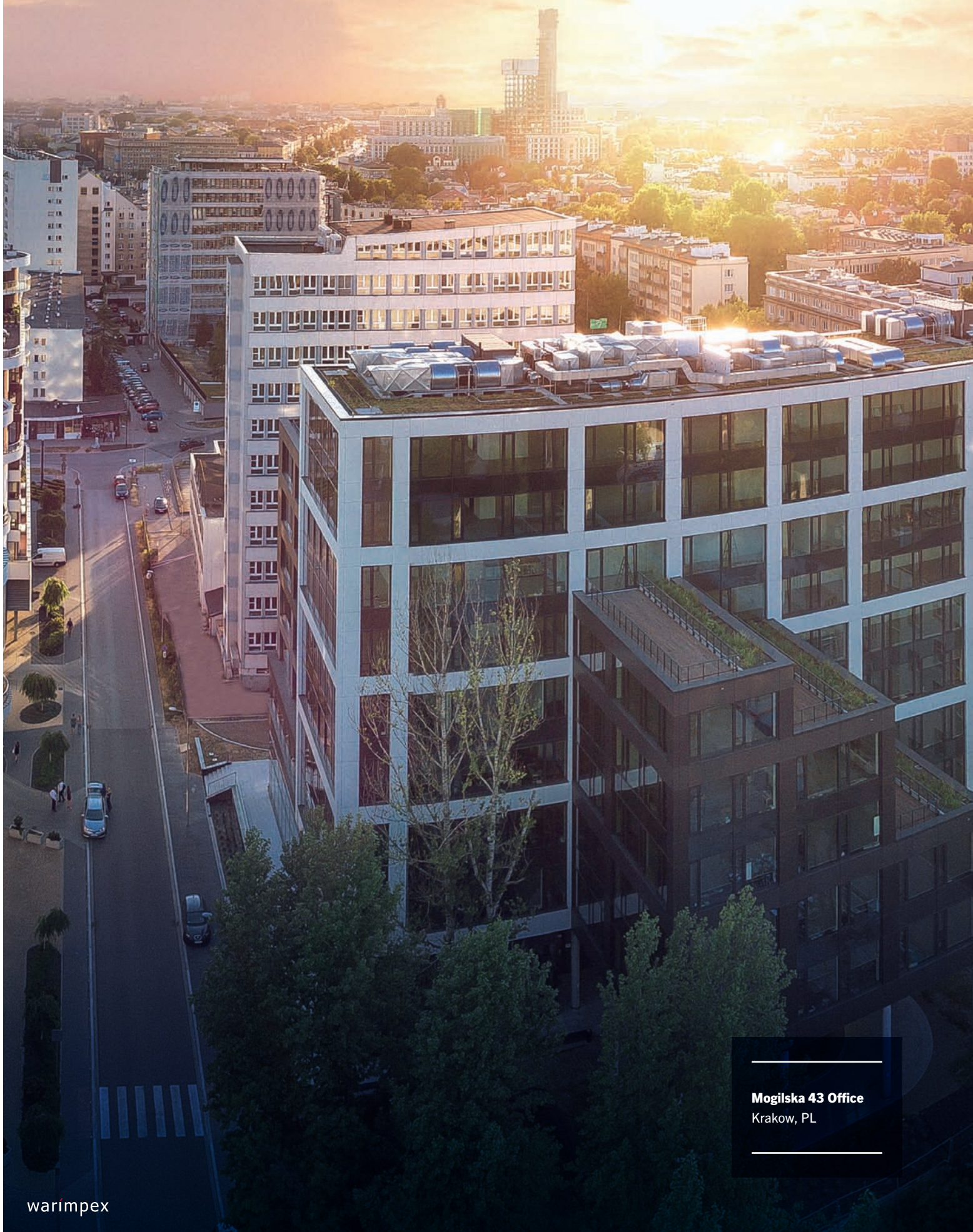
Mogilska 43 Office Krakow, PL