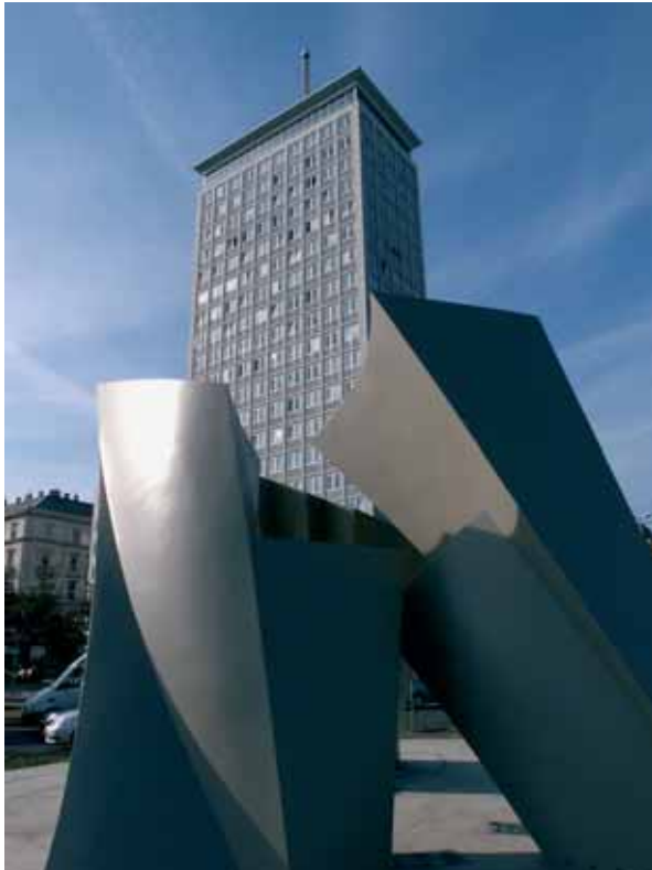
Ringturm – Headquarter of Wiener Städtische