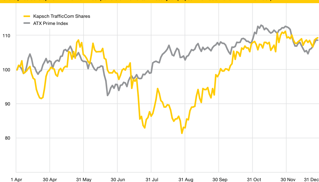
Share price development in the first three quarters of the 2013/14 fiscal year (Kapsch TrafficCom and ATX Prime Index)

The final price of the Kapsch TrafficCom shares and final value of the ATX Prime Index on 31 March 2013, both indexed to 100.