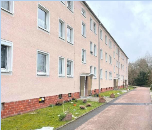
Rossau, Am Sportplatz 8 (1st floor left)

One property with a living space of 58 m 2 was acquired in the land register in the first half of 2024. Two further flats with a living space of 63 m 2 and 58 m 2 have yet to be entered in the land register.