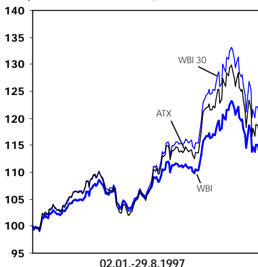
WBI, WBI 30 und ATX 1) / WBI, WBI 30 and ATX